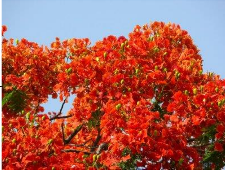
Delonix Regia in full bloom, New Delhi